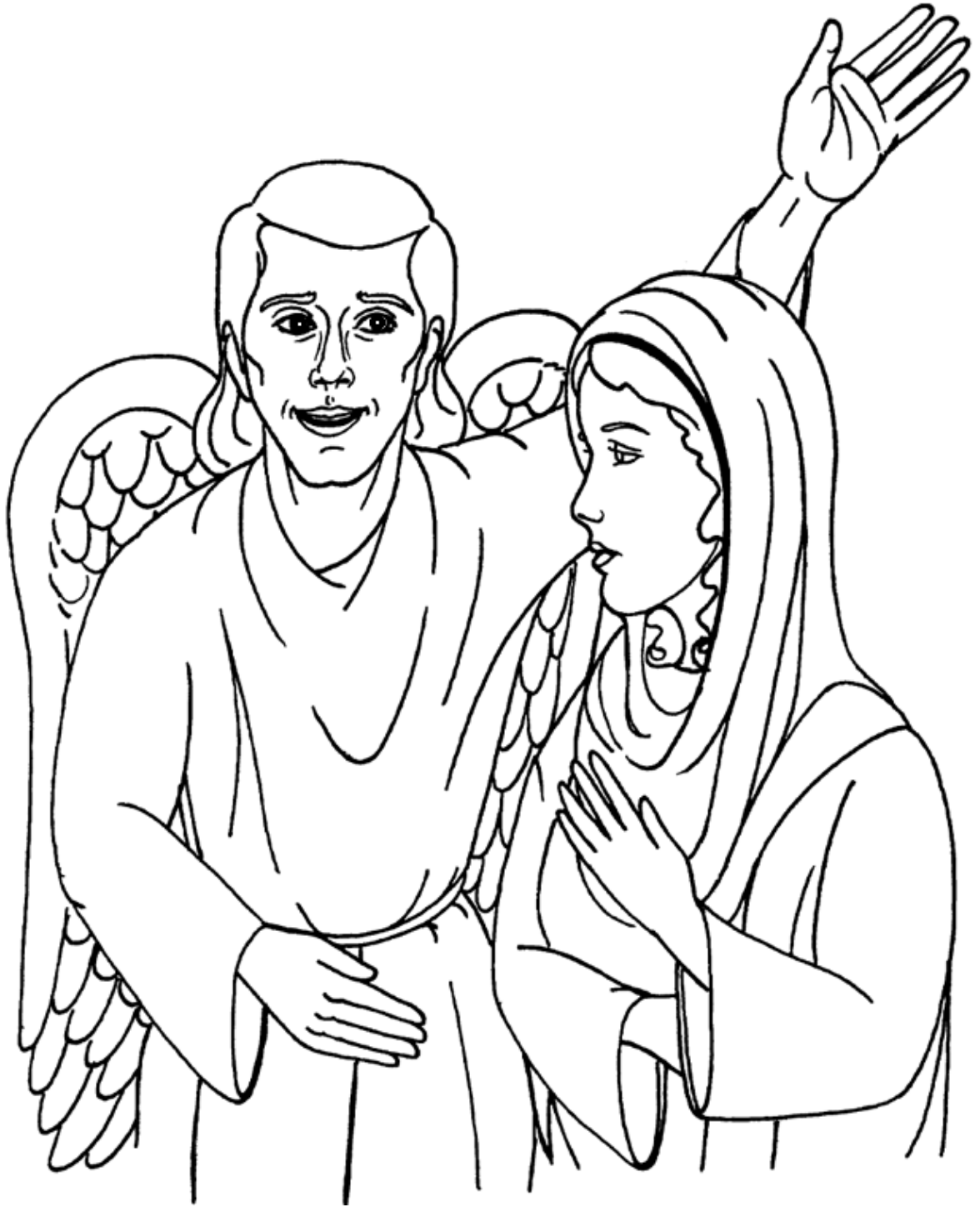
The Angel Gabriel Appears to Mary Luke 1:26-38