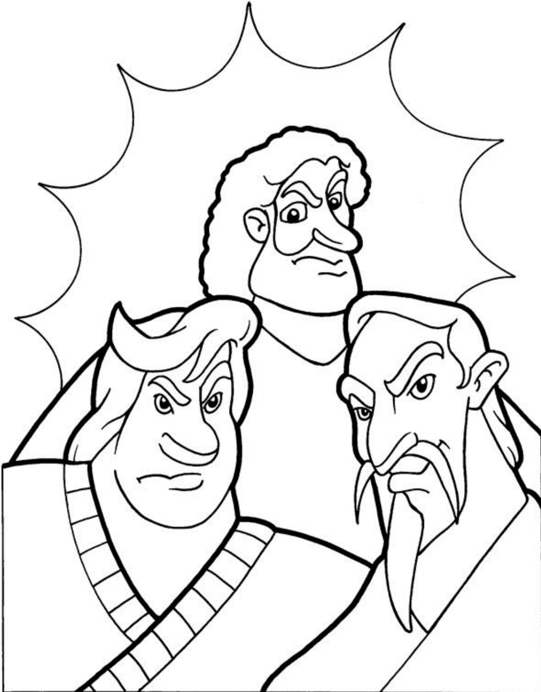
The Parable of the Tenants Matthew 21:33-46