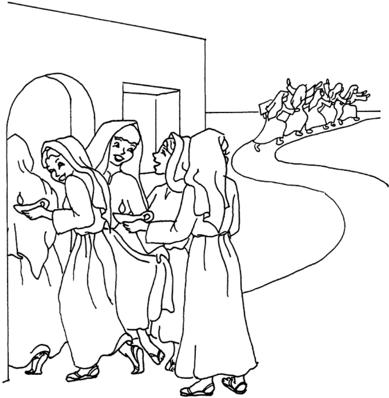
The Parable of the Ten Bridesmaids Matthew 25:1-13