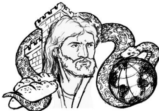
The Temptation of Jesus