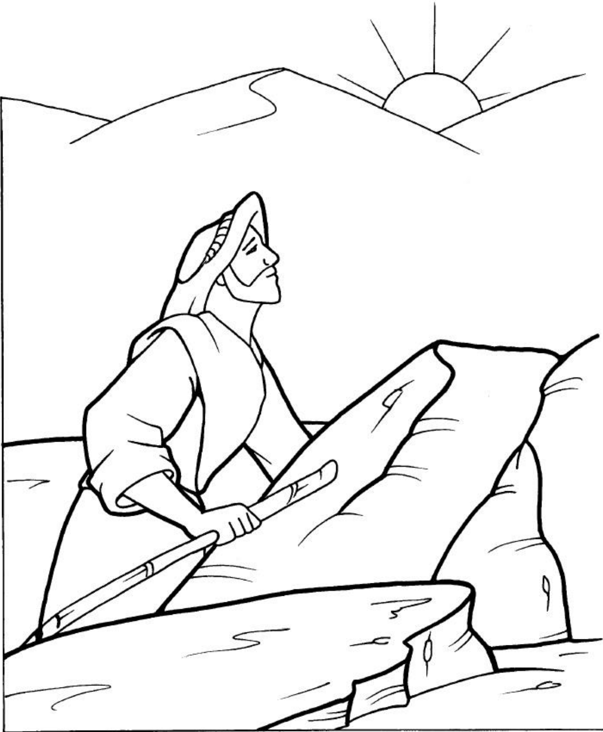
The Temptation of Jesus

Lutheran Church of the Good Shepherd 4200 Olney-Laytonsville Road | PO Box 280 Olney, Maryland 20830-0280 Phone: 301-774-9125 www.OlneyGoodShepherd.org