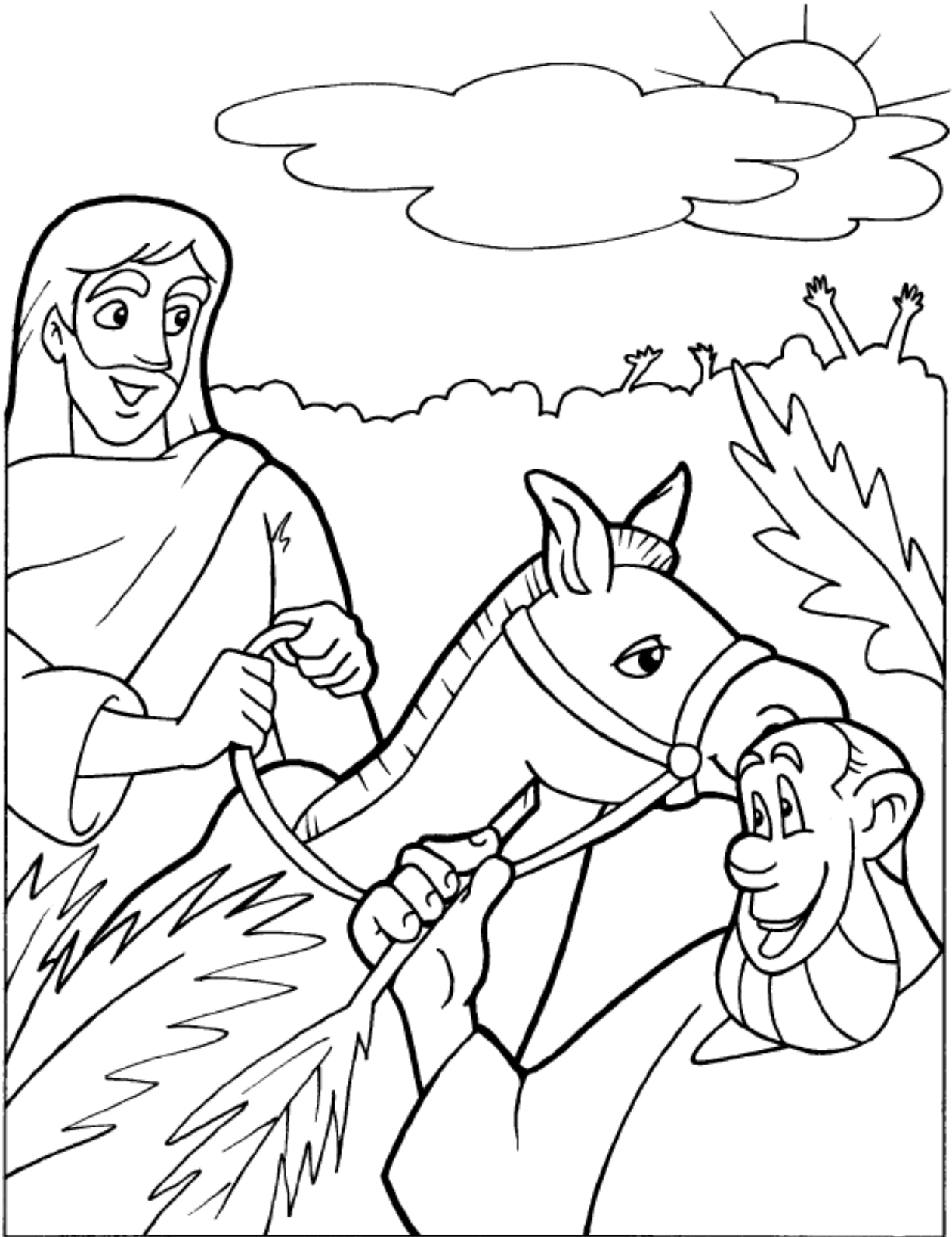
The Triumphal Entry