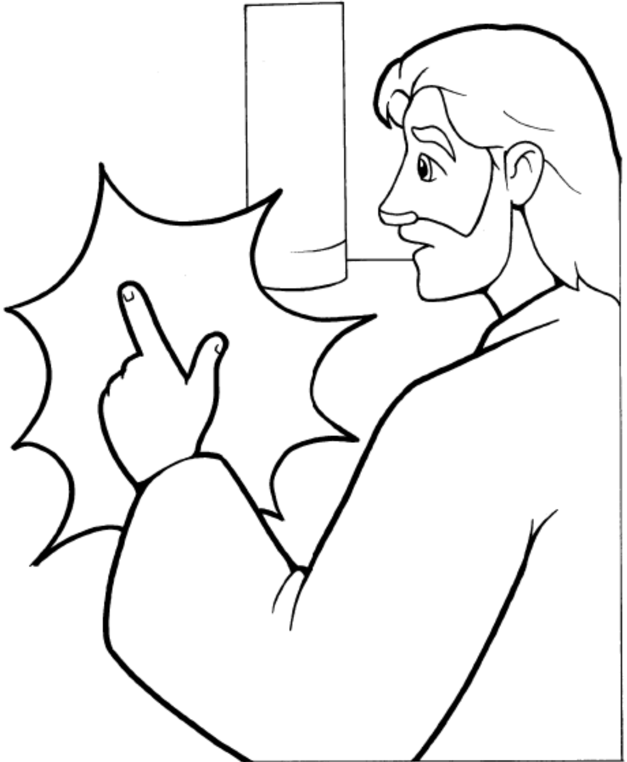
Jesus Appears to the Disciples