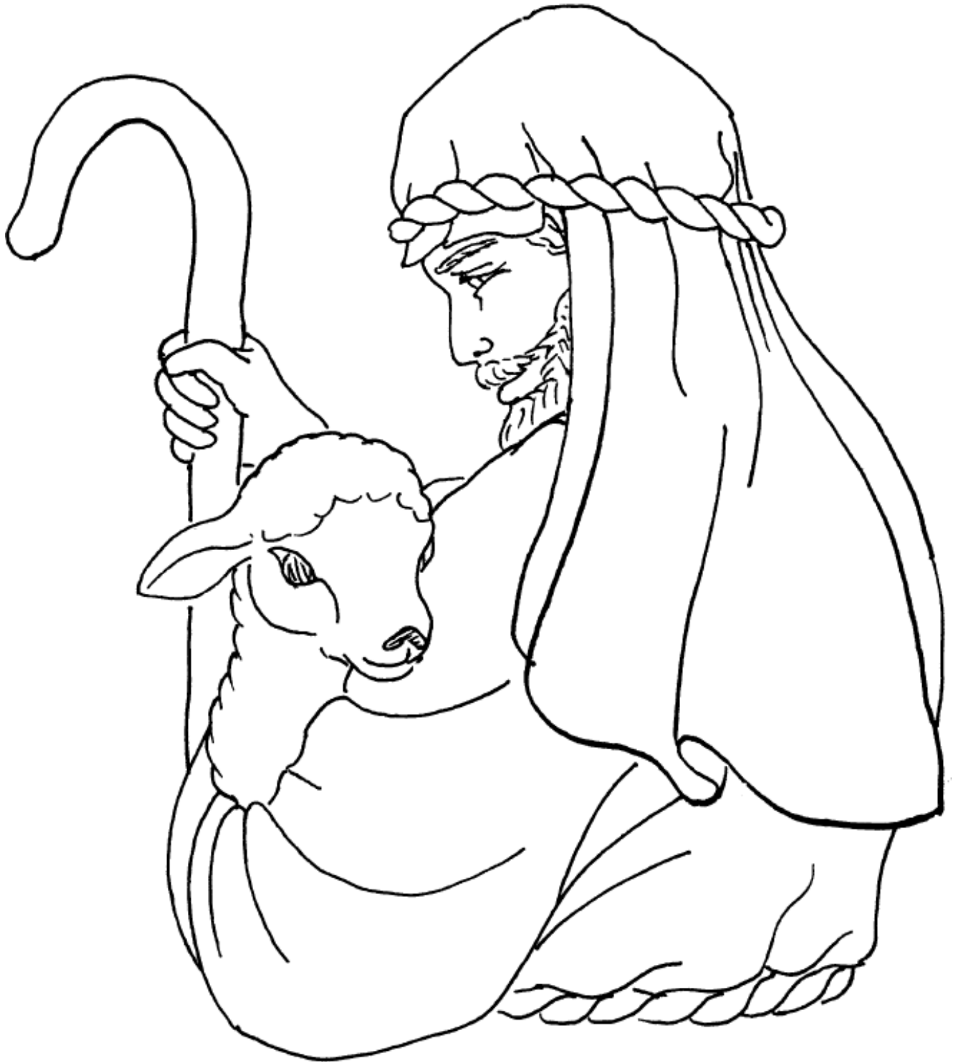
The Good Shepherd