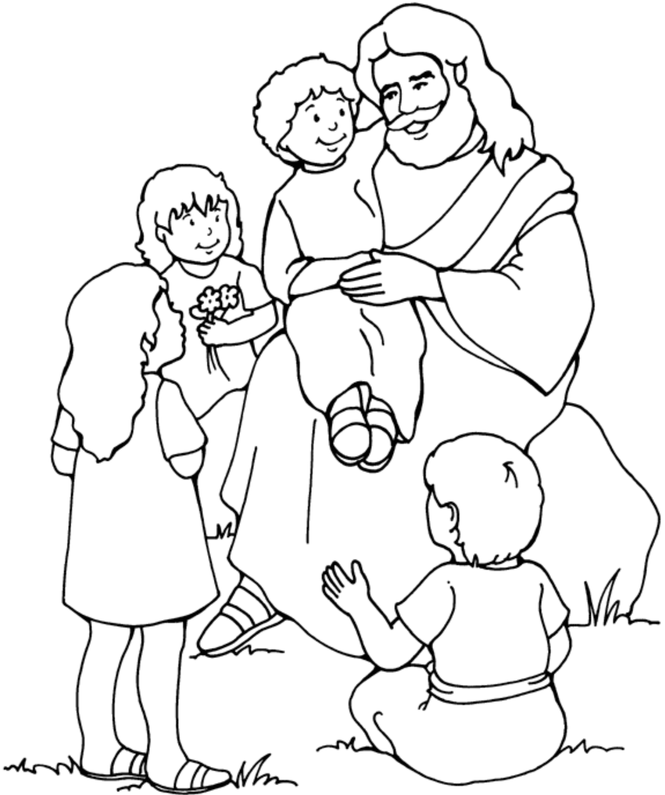
Jesus and the Children