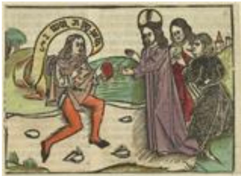
Christ and the Rich Young Man