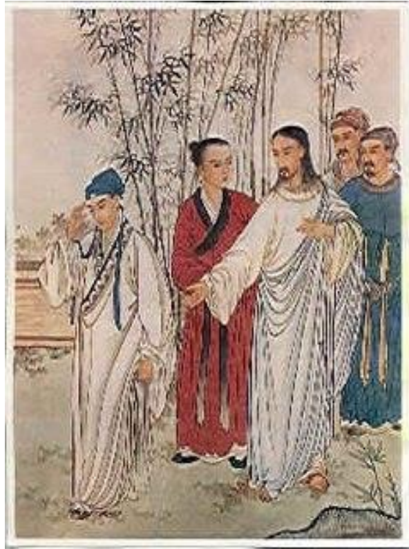
Chinese depiction of Jesus and the rich young man