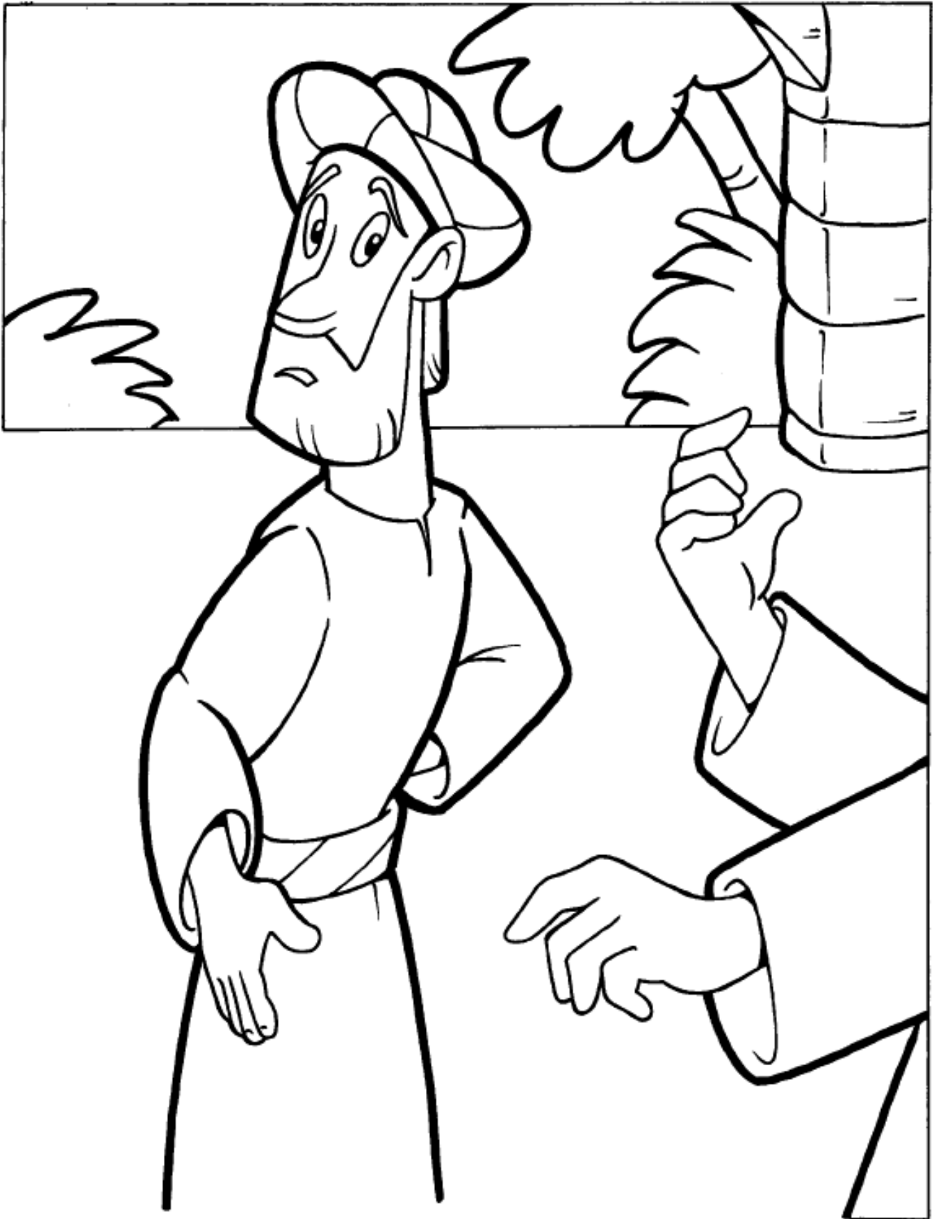
The Rich Young Ruler