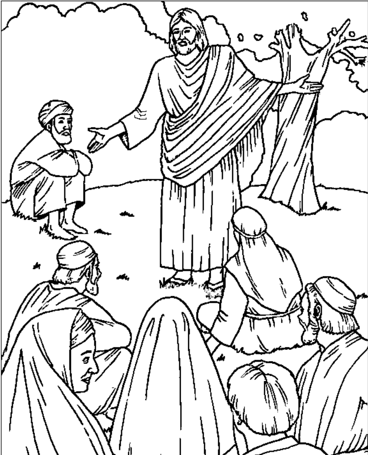
The Sermon on the Mount Matthew 5:1-12