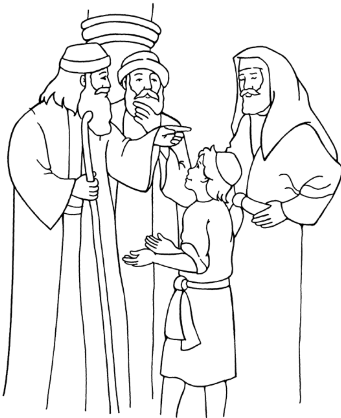
Jesus in the Temple Luke 2